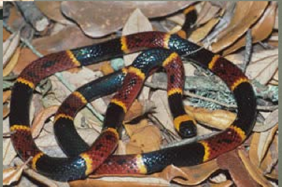
Eastern Coral Snake